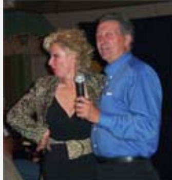
Bette Midler Impersonator entertains the Sin City Chamber.