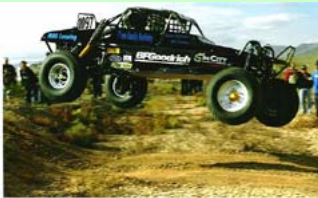
Dicton Racing's Class 10 Buggy - sponsored by the Sin City Chamber of Commerce. Off-road racing at it's finest.

Always Different, Always Fun. Come join us at the next Sin City Event